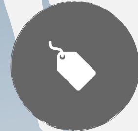
Digital & Smart Solutions