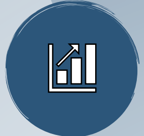
Active Market Research & analysis