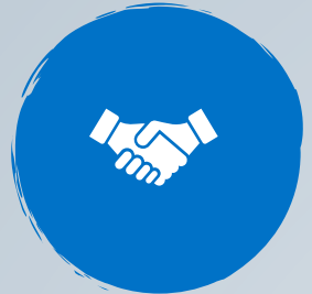
International Business Network